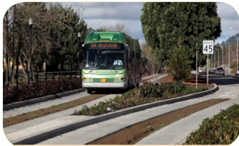
Bus Rapid Transit (BRT)