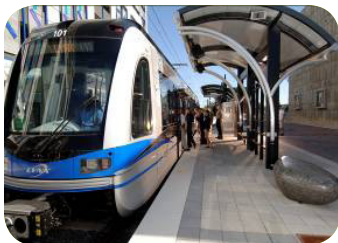
Light Rail Transit (LRT)

Idea Development identifies transportation challenges that provide the background for developing the Purpose and Need and goals and objectives for the project. Idea Development also lists the broad range of alignment and transit technology alternatives that could be combined for a fixed-guideway transit investment. The Durham-Wake Corridor included 3 alignment alternatives and 3 transit technology alternatives: Bus Rapid Transit (BRT), Commuter Rail Transit (CRT), and Light Rail Transit (LRT).