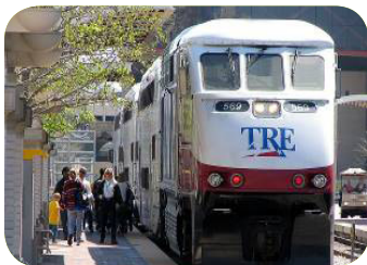
Commuter Rail Transit (CRT)